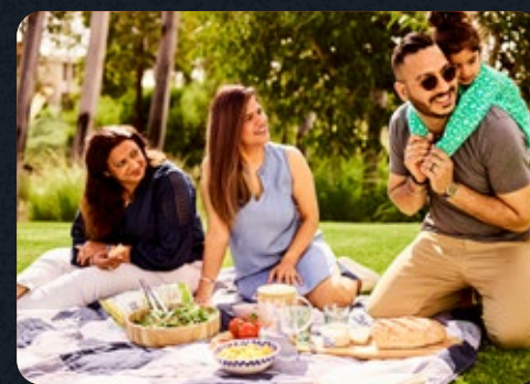
Picnics & relaxing