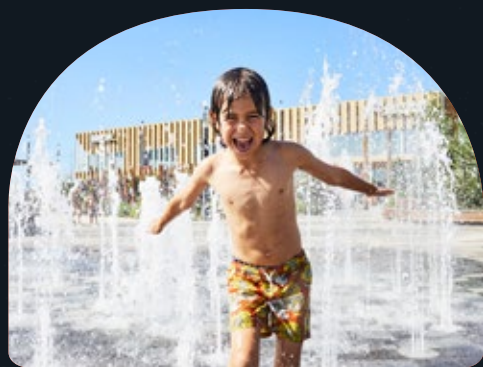
A hot summer's day