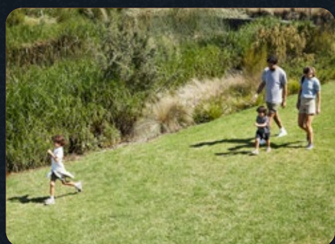
Nature & exploring