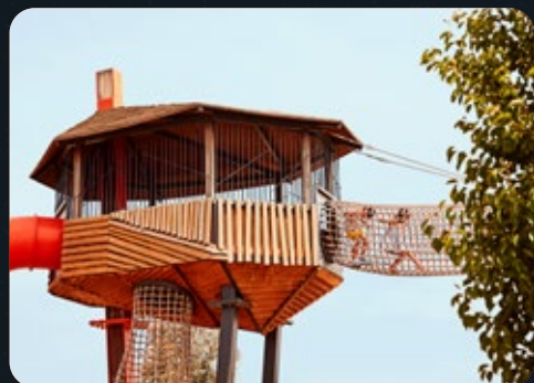
Adventure & keeping the kids entertained