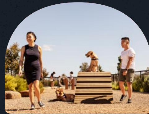
Your furry friends