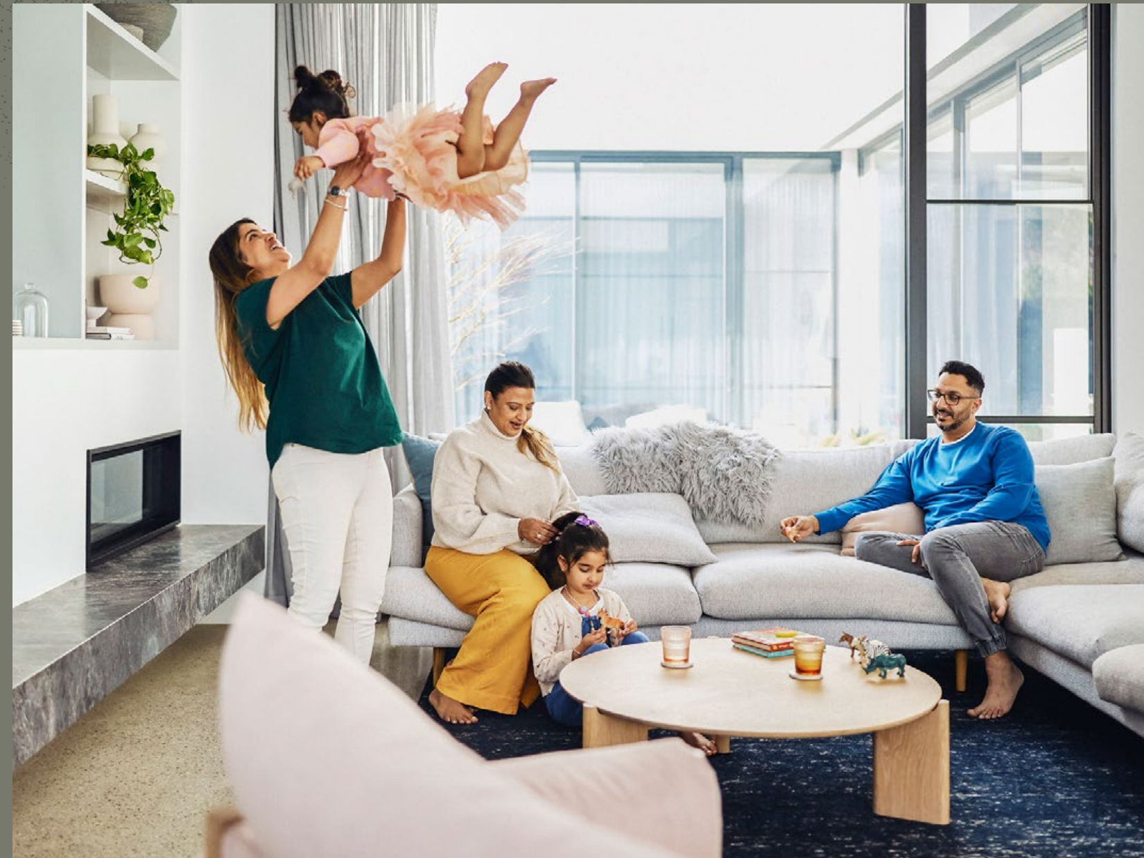
LAND LOTS FOR HOMES OF EVERY STYLE