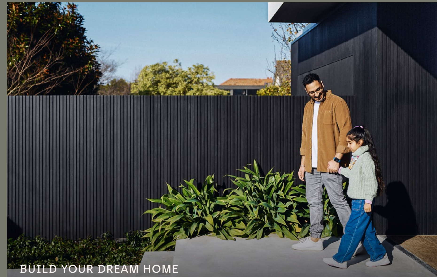
BUILD YOUR DREAM HOME