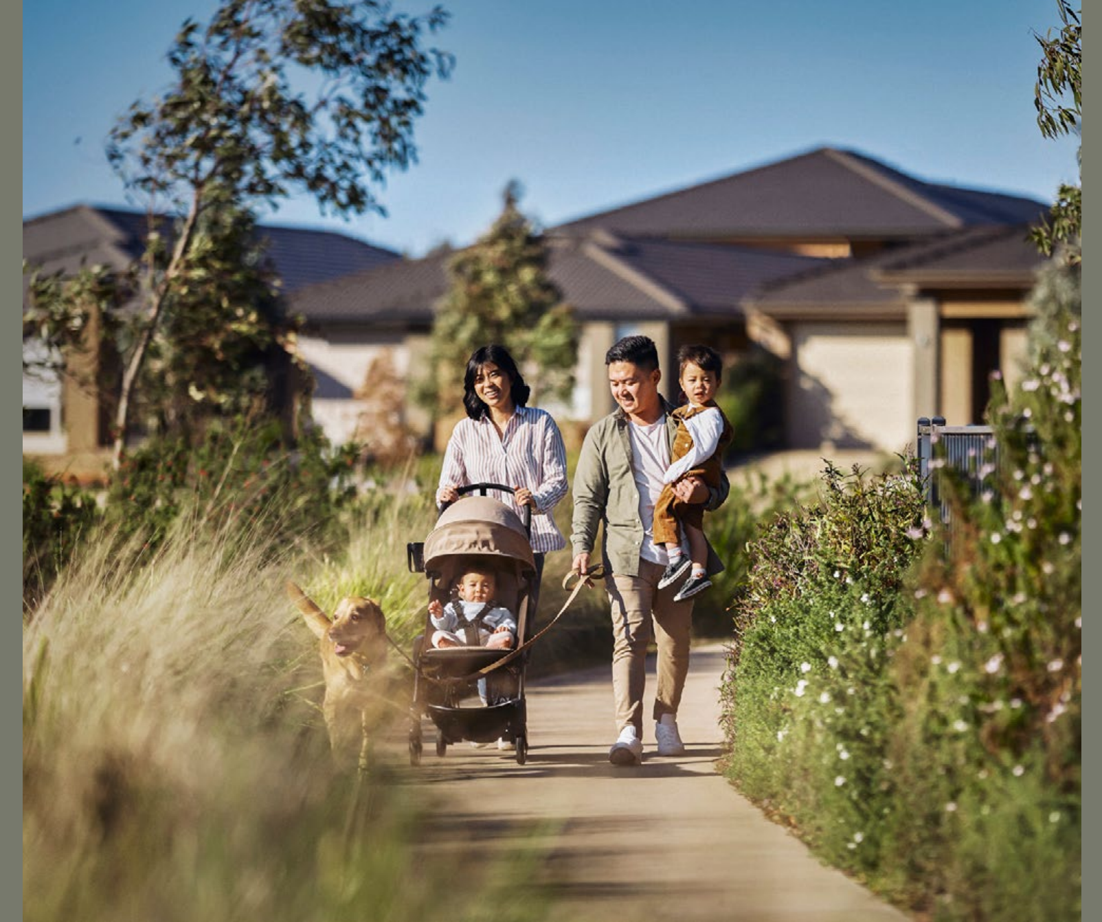
PRIME LOT LOCATIONS