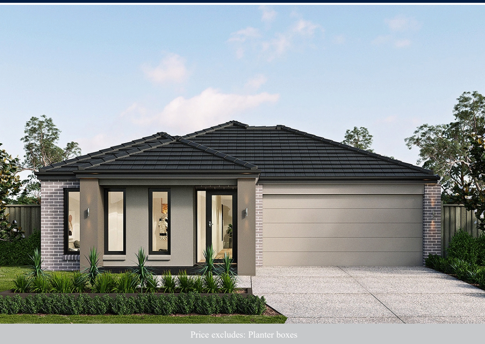
Price excludes: Planter boxes