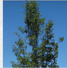
Pyrus Betulaev 'Southworth'