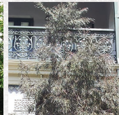
Burgundy Willow Myrtle