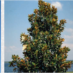
Magnolia Little Gem