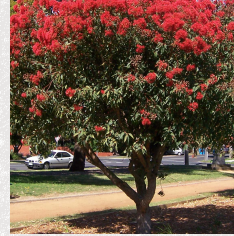
Dwarf Red Flowering Gum